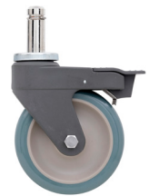
5PCBM Antimicrobial Tread Swivel Brake