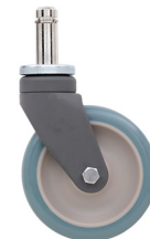
5PCM Antimicrobial Tread Swivel