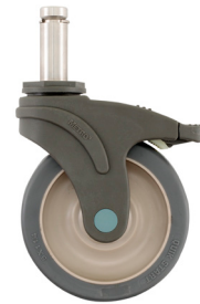
5PSTEB Total Lock