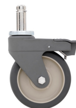
5PCB Swivel & Brake