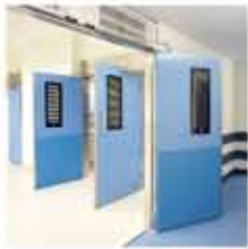
• Hinged Hygienic Doors