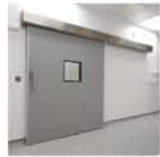
• Hermetically Sealing Doors