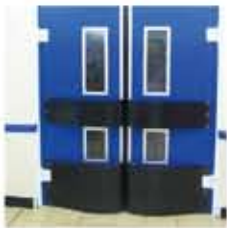
• Traffic Doors