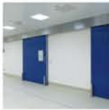
• Sliding Hygienic Doors