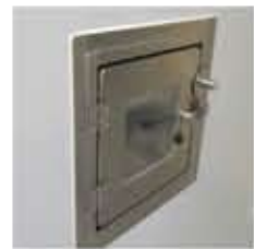
• Transfer and Trolley Hatches

Acoustic Doors Coldstore Doors Fire Doors FRP Doors Glass Doors GRP Doors Hermetic Doors Hygienic Doors Rapid Roll Doors Sliding Doors Traffic Doors Transfer Hatches Waterproof Doors Windows X-ray Doors