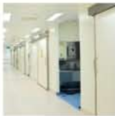
• X-ray Rated Doors