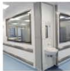
• Windows and Vision Panels