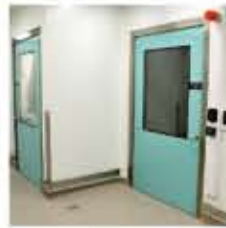
• Fire Rated Hygienic Doors